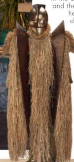
Left: Dido Costume for The Tragedy of Dido Queen of Carthage by Arnaldo Pomodoro, 1986

Having opened earlier this month directly across from the Mausoleum of Augustus, every inch of the Bulgari Hotel Roma (left and below) pays tribute to the ancient roots of La Città Eterna . Brush up on your history in the on-site Reading Room and then decamp to Fendi's headquarters at Palazzo della Civiltà Italiana, where the house is currently staging a theatrical retrospective of sculptor Arnaldo Pomodoro's monumental metallic works. From £1,650 per night. Bulgarihotels.com/rome