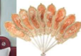
Above: advertising fan, Au Bon Marché , circa 1910